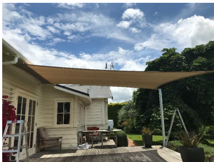
Typical Residential Shade Sail